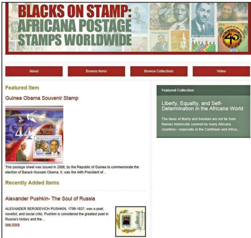
Screenshot of Blacks on Stamp home page.